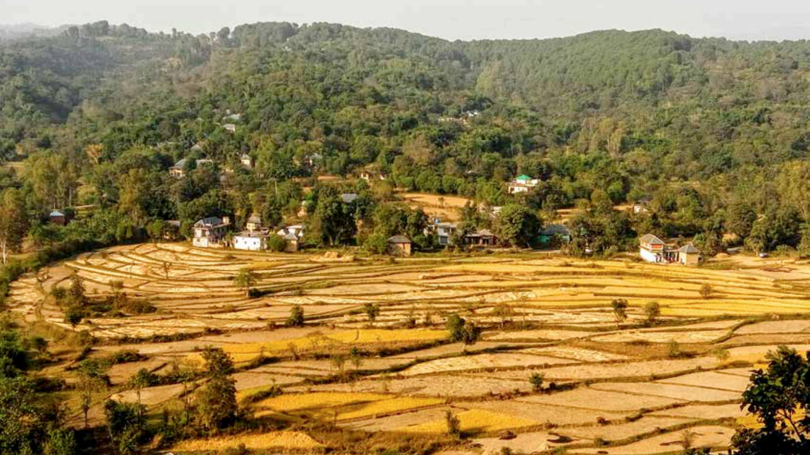
Villages in Hamirpur

P eople in Hamirpur, Himachal Pradesh think of leopards as not mere instinct driven animals but as adaptive beings who respond to specific situations. They are seen as thinking beings, possessing qualities such as