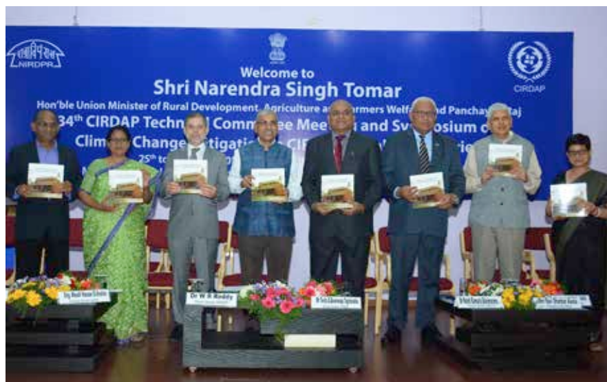
Dignitaries releasing book – 'Creating Masterpiece-Using appropriate building technologies'

This is the third time India is hosting the CIRDAP Technical Committee meeting and this is the first time it is being hosted by NIRDPR. The last Technical Committee meeting was held in Fiji. The Centre on Integrated Rural Development for Asia and