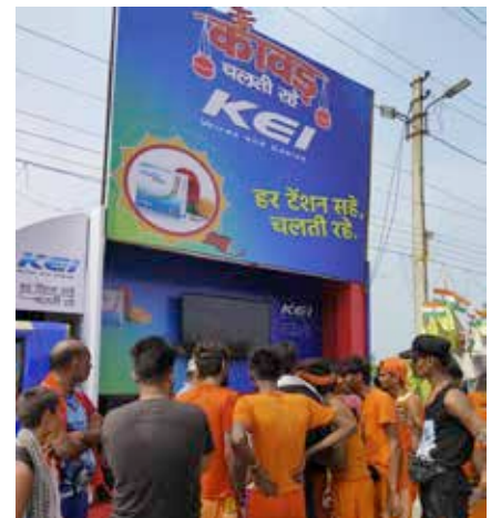
KEI Industries supports Sawan Kawad Rally by ensuring safety and connectivity for people

The mobile van will be accompanying the devotees through multiple cities, spreading their services even in the smaller towns such as Haridwar, Muzaffarnagar, Meerut, Seohara, Dhampur, Bijnor, Ghazipur, Mau, Azamgarh, Sultanpur, Lucknow, Unnao and Kanpur among others.