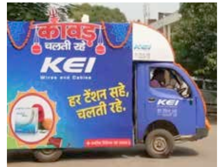
Mobile Vans providing first aid and connectivity to thousands of Kanwaris